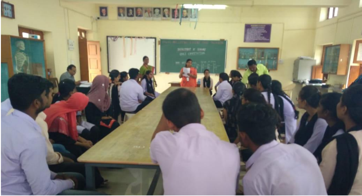
Staff and Students in quiz programme