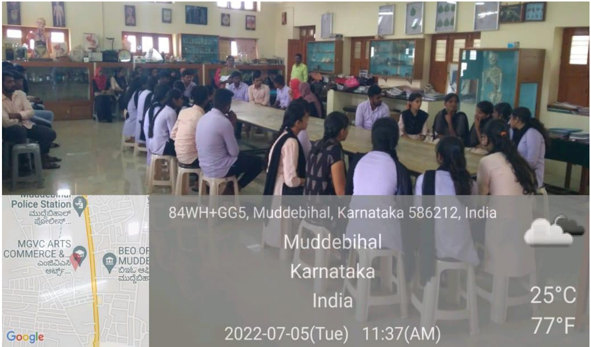
Active Participation of Students in quiz programme